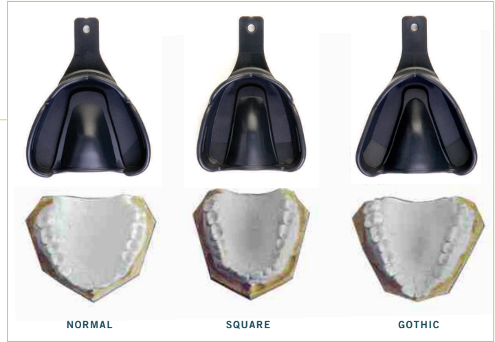
Semi-Custom Shape: The BORDER-LOCK trays have been developed according to the three most common dental arch shapes.

To improve impression quality it is necessary to minimize impression volume. The BORDER-LOCK program goes far beyond the conventional sizing options of small, medium and large. BORDER-LOCK trays are designed according to the three most common dental arch shapes: Normal, Square and Gothic. To accommodate different arch sizes, several trays are available within each shape. In many cases, the precise fit of the BORDER-LOCK tray eliminates the need for laboratory made custom trays.