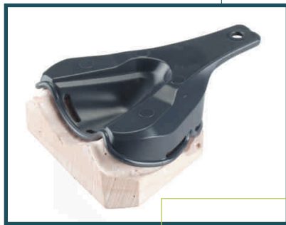
The BORDER-LOCK tray completely seals the impression space creating optimal dynamic pressure. The impression material does not escape towards the throat.