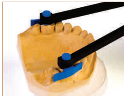
Accurate tray selection using the measuring caliper.